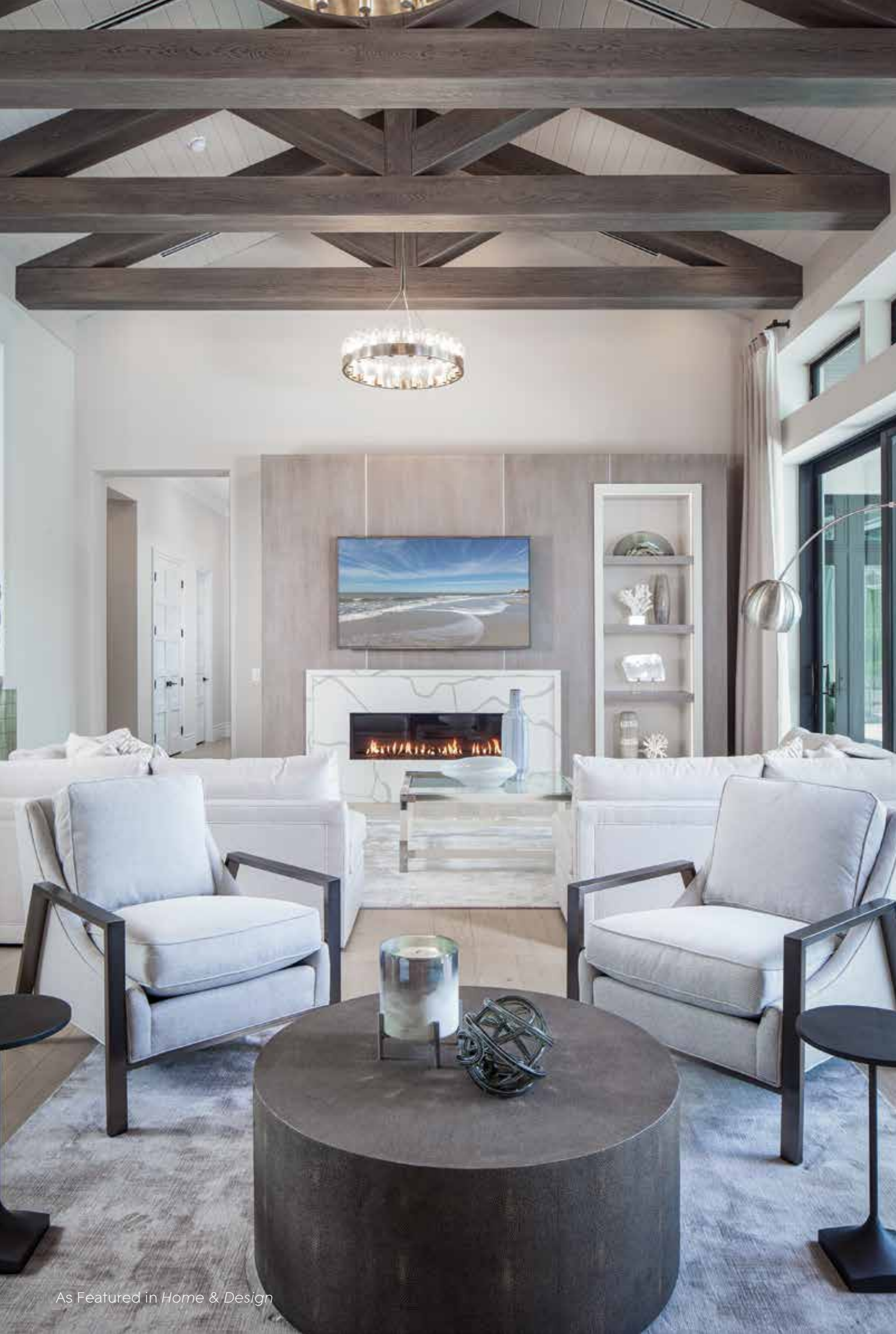
As Featured in Home & Design