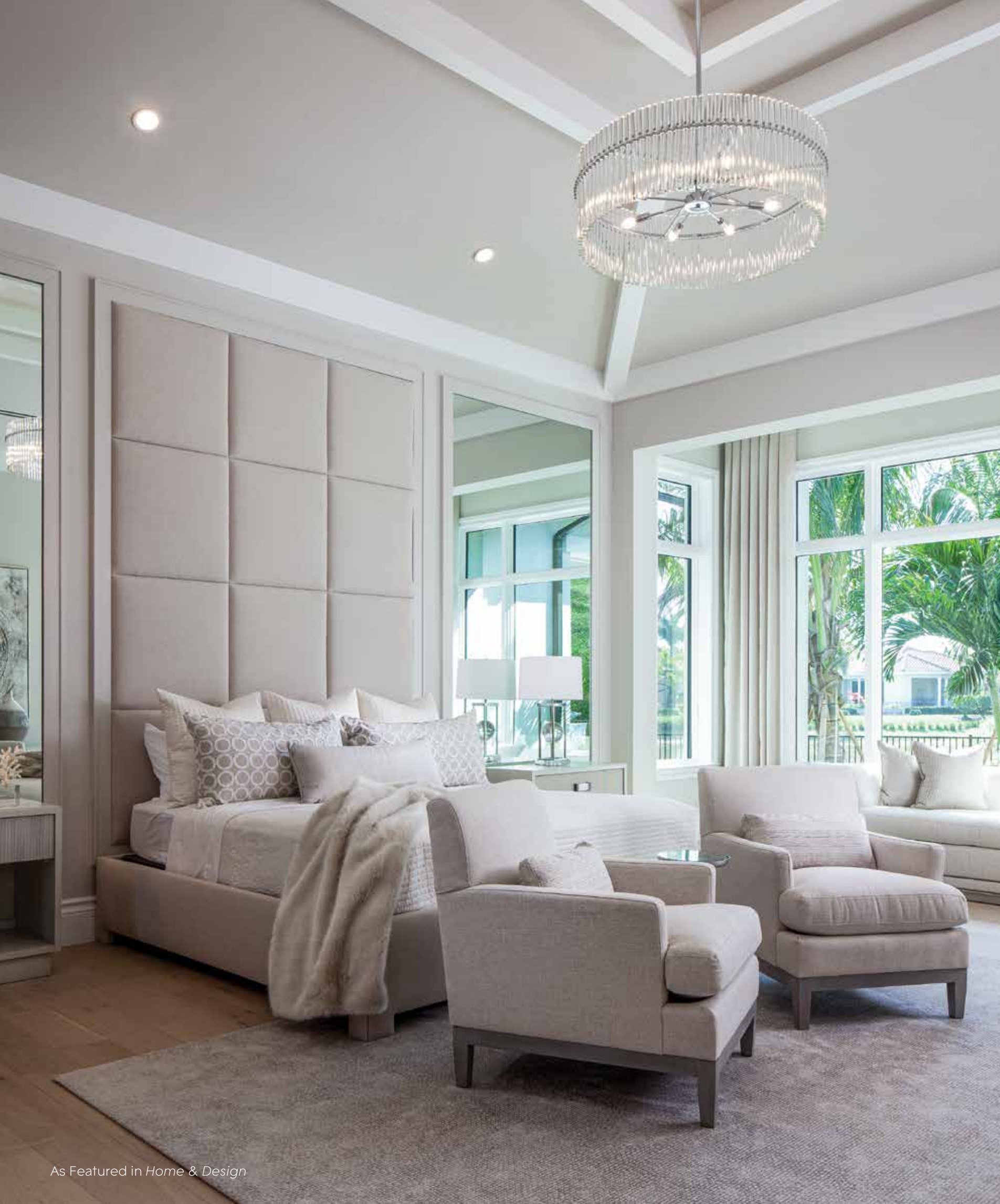
As Featured in Home & Design