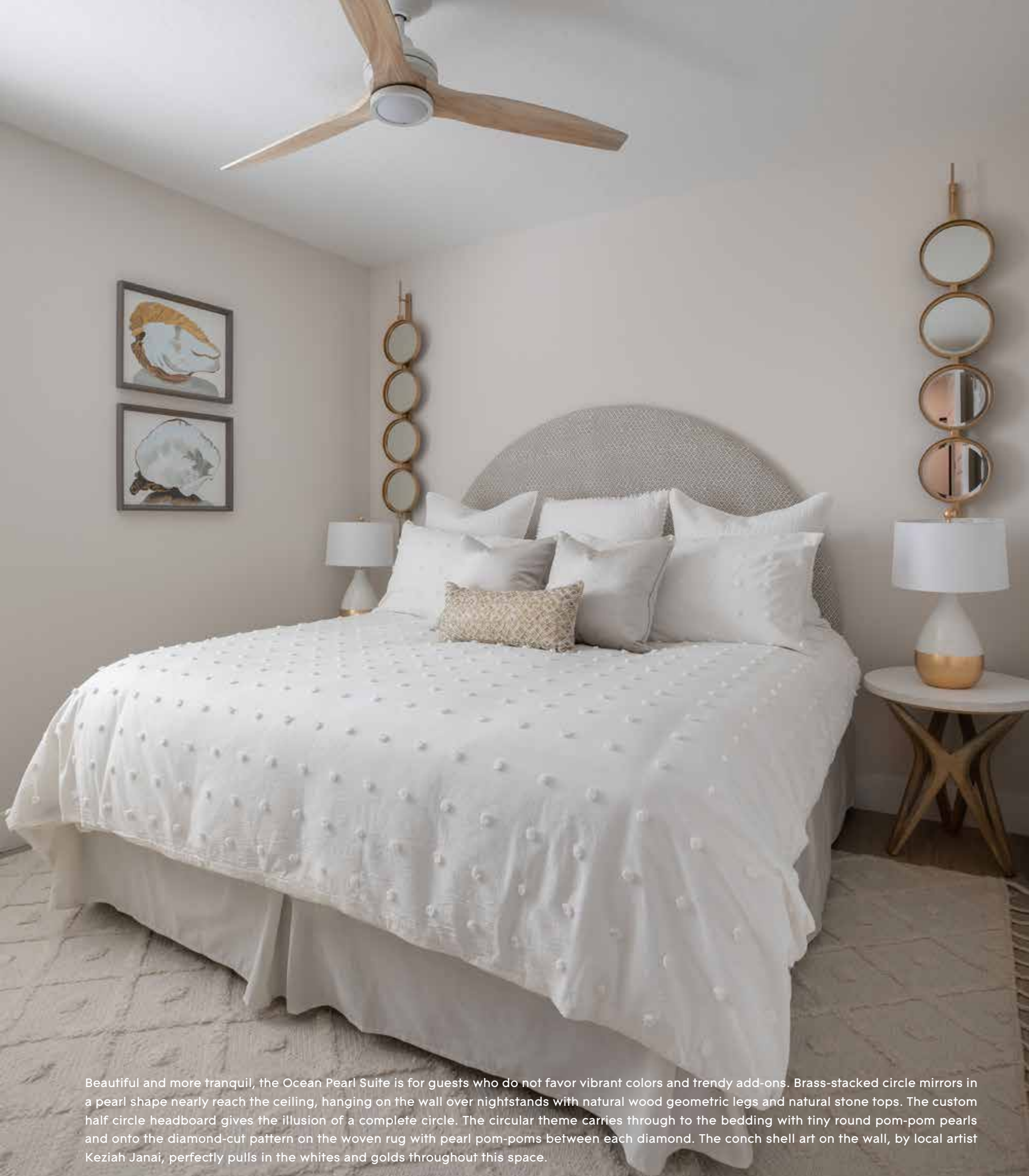
Beautiful and more tranquil, the Ocean Pearl Suite is for guests who do not favor vibrant colors and trendy add-ons. Brass-stacked circle mirrors in a pearl shape nearly reach the ceiling, hanging on the wall over nightstands with natural wood geometric legs and natural stone tops. The custom half circle headboard gives the illusion of a complete circle. The circular theme carries through to the bedding with tiny round pom-pom pearls and onto the diamond-cut pattern on the woven rug with pearl pom-poms between each diamond. The conch shell art on the wall, by local artist Keziah Janai, perfectly pulls in the whites and golds throughout this space.