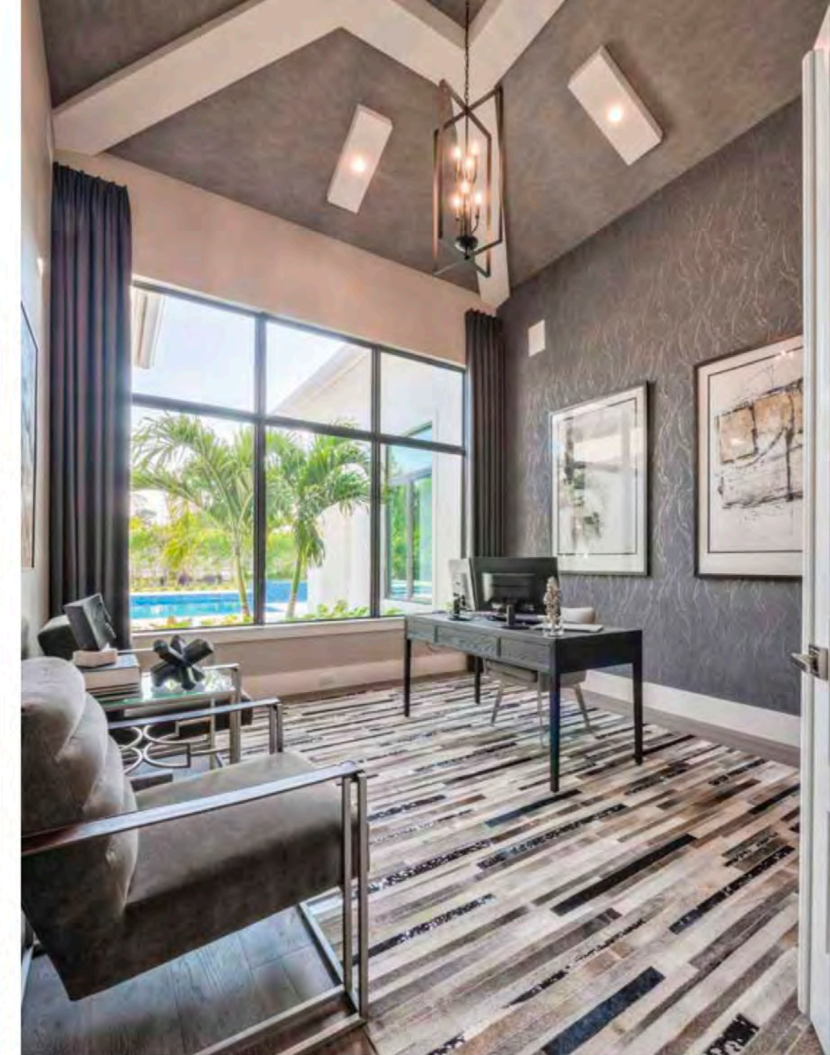
Study: The dark gray tones in this study, seen in the Upstream wallcovering and Mirage on the ceiling — both from York's Urban Oasis collection — combined with leather accents and a cowhide rug give the space a decidedly masculine look, according to Emanuel. Large artwork makes a statement behind an understated desk, while dark curtains frame an expansive window overlooking the pool. "People are using their home offices more today, and they don't want to be in a closed room," he says. "They can sit here, work on their laptop, and enjoy the outdoor views."