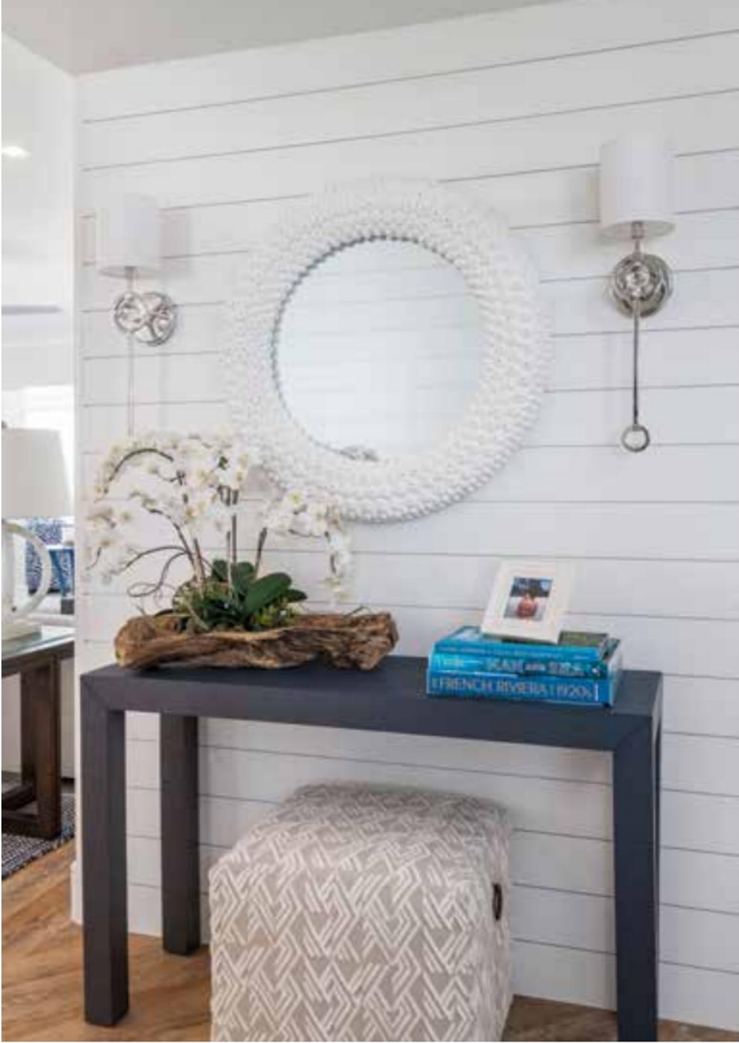
Foyer: This foyer introduces the elegant coastal flavor that accentuates each space in this guest retreat. White nickel gap wood siding clads the wall — a backdrop that repeats on the nearby dry bar. Two polished nickel and white silk shade Savoy House sconces flank the sea urchin shell design mirror frame in a white cast resin from Made Goods. Below these nautical accents is a dark navy seagrass console table from Bungalow 5, which is a textural element that simultaneously reveals the accent color seen throughout.

White nickel gap wood siding and coastal accents enliven this previously modest foyer. Howard and Schwenk immediately note that the old great room layout positions guests away from the Gulf view. To correct this faux pas, the team relocates the media center and incorporates it into a dry bar, giving guests a clear line of sight to the television, the fabulous statement wall, and a spectacular view. ►