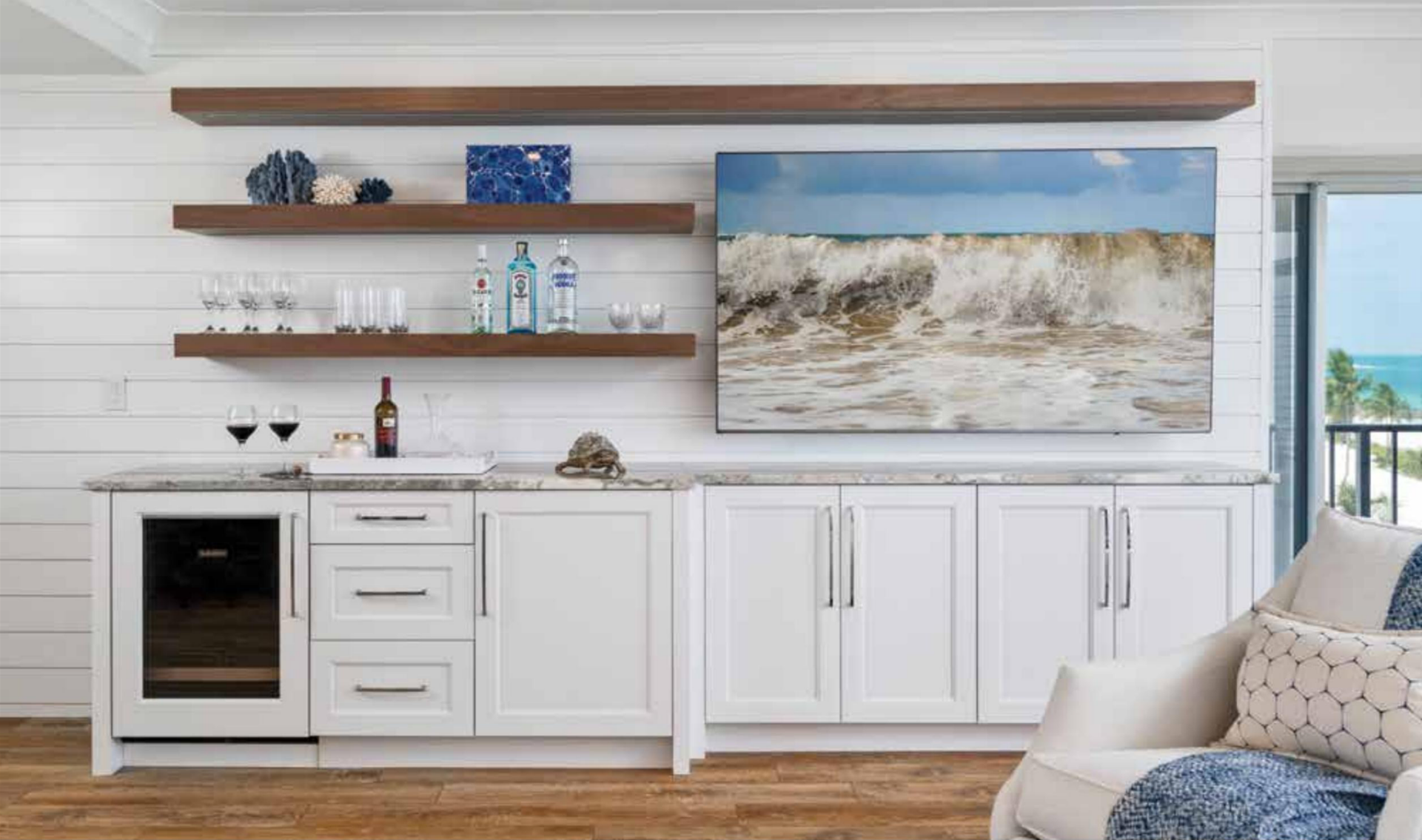
Media Wall: As this wall is visible when you first enter the condo, Howard and Schwenk create a dramatic visual with the dry bar and media center. This ample bar space features a luxurious Sub-Zero under-counter wine refrigerator, while the white cabinetry with polished nickel pulls harken back to the style of the nearby kitchen. Warm walnut shelves define this space, which Schwenk expertly accessorizes, sharing her secret, “I vary texture, color, and shape when I accessorize.”